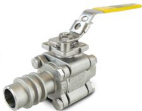
Multi-Choice with Extended End by NPT